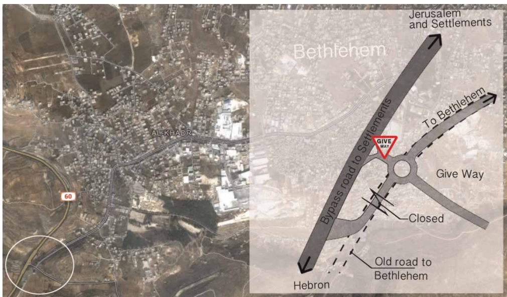
Figure 3. South entrance of Bethlehem, Google Maps 2014. Author's illustration.

The watchtower, signpost, steel gate, concrete blocks and roads junctions are the basic components of the entrance/exit of Palestinian populated centres. Put together, these standardised components constrain the Palestinian spatial mobility at a relatively low cost. These structures are economical, generalisable and replicable all over the West Bank. Indeed, an individual soldier stationed at a watchtower may effectively observe, judge the situation and analyse the imagery coming from the CCTV cameras. When necessary, s/he may call for military backup to be deployed on site to activate the checkpoint or shut the gate; once the job is complete, the