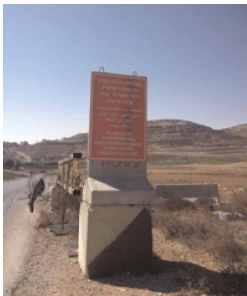
Figure 2. A red sign at the entrance of a Palestinian town warning Israelis off travelling to ‘Palestinian Areas’, 2013.

‘Area A’, as articulated in Article XI of the Oslo II Agreement signed in 1995 by Israel and the PLO. 20