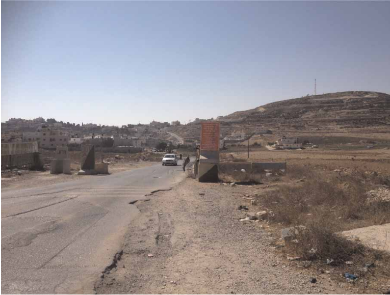
Figure 4. Gated entrance of Al-Fawar refugee camp located in southern Hebron, 2013.

backup force can leave for another task. Third, the junctions' layout itself is designed to exercise systematic power to modulate movement. The layout imparts a speed and priority differentiation between native and settler vehicles to cater for the latter's comfort and safety. The natives are forced to travel at a lower speed while giving way to settlers.